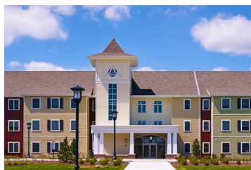
Prairie Place Residence Hall

annual Welcome Back Picnic . Staff will have games, music and other entertainment ready and a picnic style dinner will be served.